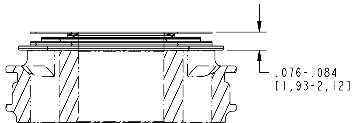
SECTION A-A SCALE 4:1

Valve: Metric [12.0 mm OD X 9.58mm ID X 0.25mm TH]